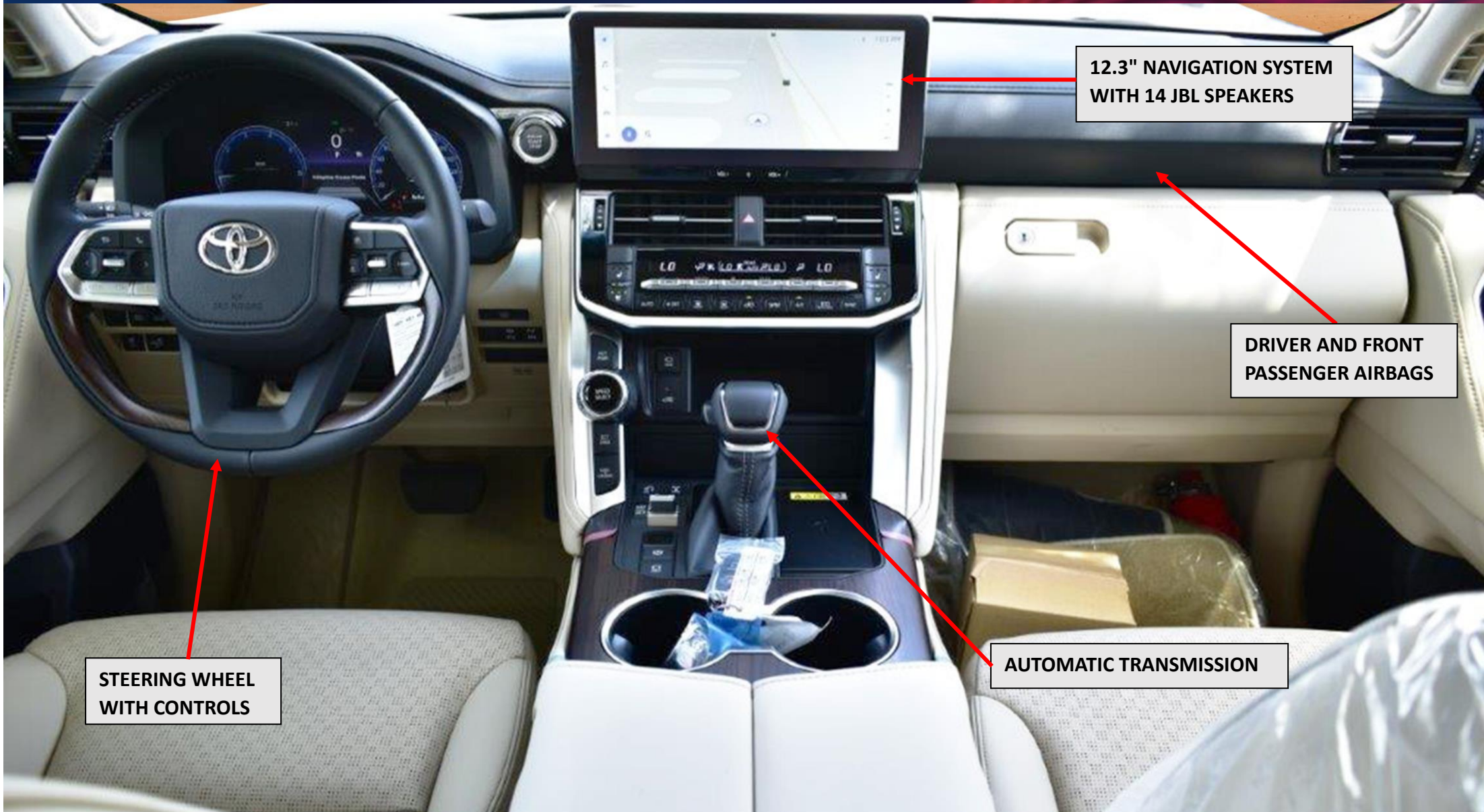
STEERING WHEEL WITH CONTROLS